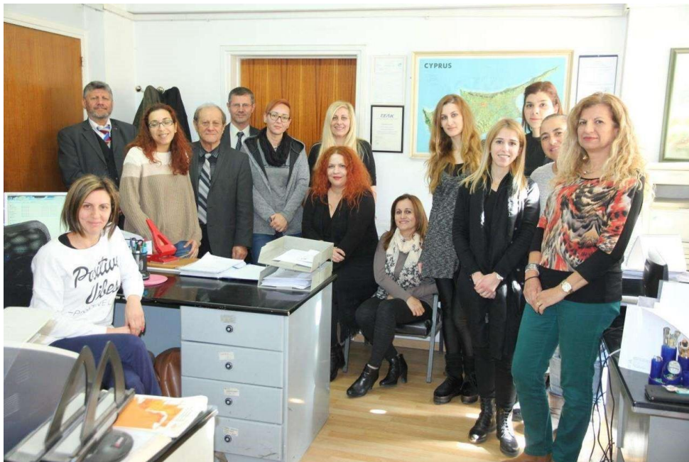
MEET OUR TEAM

A business dedicated to providing high-quality financial, tax, and consulting services to our clients.